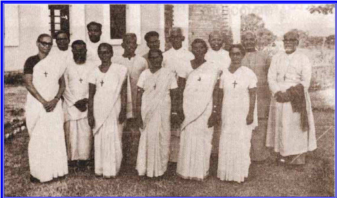
Sihora Ashram Family 1974