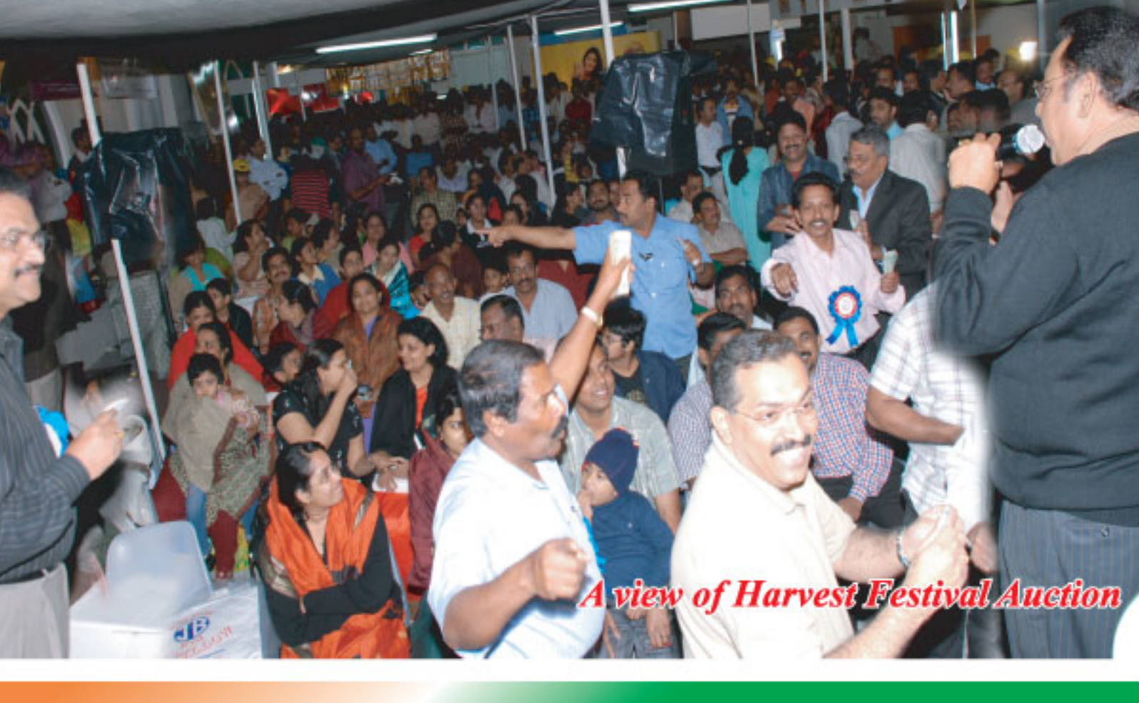
A view of Harvest Festival Auction